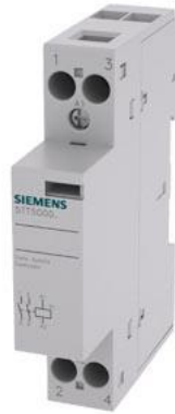
insta contactor with 2 NO contact for 230 V AC, 400 V 20 A control 24 V AC