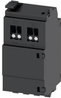
24 V module accessory for: 3VA20/21/22