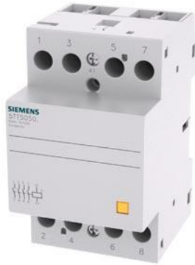
insta contactor with 4 NO contact for 230 V AC, 400 V 63 A control 230 V AC