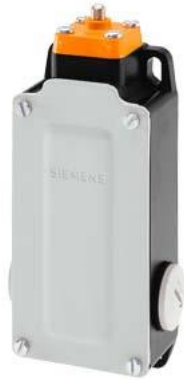
POSITION SWITCH, METAL-ENCLOSED DEGREE OF PROTECTION IP67, SLOW-ACTION CONTACTS, MOULDED-PLASTIC ROD, 3 X M20 X 1,5