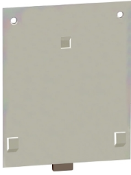
plate for mounting on symmetrical DIN rail, Phaseo ABT7 ABL6, for voltage transformer, size 1