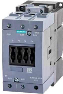
Contactore DC 24 V AC3 30 kW 400 V 3-pole, size S3 screw terminal