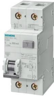
RCBO, 4.5 kA, 1P+N, type A, 30 mA, C-Char, In: 25 A, Un AC: 230 V, N left