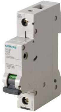
Miniature circuit breaker 230/400 V 4.5 kA, 1-pole, C, 16A