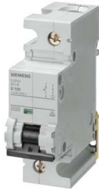
Miniature circuit breaker 230/400 V 10kA, 1-pole, B, 100 A, D=70 mm