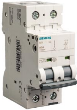
Miniature circuit breaker 230 V 10kA, 1+N-pole, C, 2A