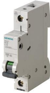
Miniature circuit breaker 230/400 V 6kA, 1-pole, D, 1.6A Circuit breaker 230/400 V 6kA, 1-pole, D, 1.6A