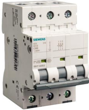
MCB Icu=15KA 400V 3P C2