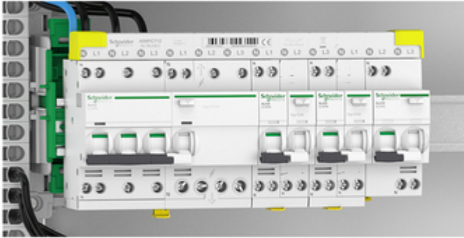
Image of assembly of product