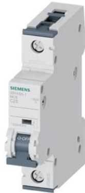
Miniature circuit breaker 230/400 V 10kA, 1-pole, C, 25A, D=70 mm