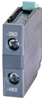
AUX. switch block , 1 NO, EN 50005, screw terminal, for motor contactor, 1-pole