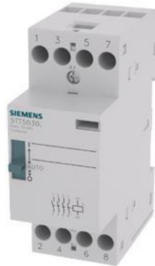
insta contactor 0/1-automatic with 4 NO contact for 230 V AC, 400 V 25 A control 230 V AC 220 V DC