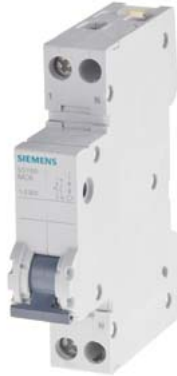
CIRCUIT BREAKER, 1MW 230V, 6KA, 1+N-POLE, C, 20A