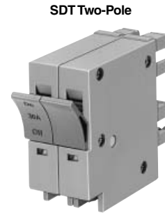
SDT Two-Pole Two Spaces Required