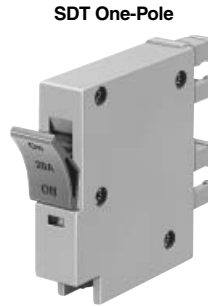
SDT One-Pole One Space Required