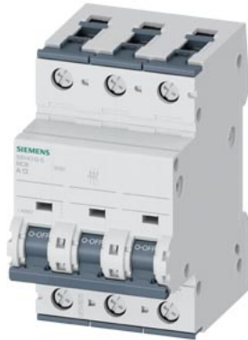
Miniature circuit breaker 400 V 10kA, 3-pole, A, 13 A, D=70 mm