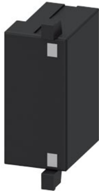
Surge suppressor, diode combination, size S0, for motor contactors