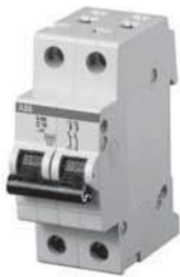
S202-D, 2 pole