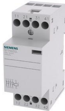
insta contactor with 4 NC contact for 230 V AC, 400 V 25 A control 230 V AC