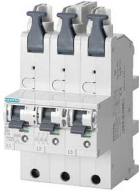
Main miniature circuit breaker (SHU), 3x 1-pole, E 35A, 230/400 V Mounting on 40 mm busbars