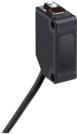
photo-electric sensor - XUM - reflex - Sn 2m - 12..24VDC - cable 2m