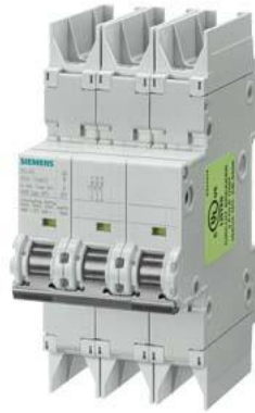
Circuit breaker 10kA, 3-pole, C, 30 A according to UL 489-480Y/277V