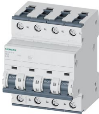
Miniature circuit breaker 400 V 10kA, 3+N-pole, A, 13 A, D=70 mm