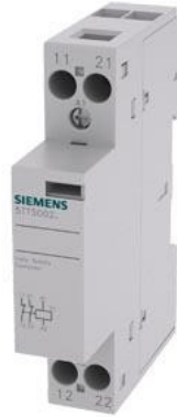
insta contactor with 2 NC contact for 230 V AC, 400 V 20 A control AC/24 V DC