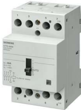
insta contactor 0/1-automatic with 4 NO contact for 230 V AC, 400 V 40 A control 24 V AC