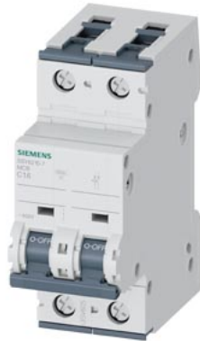
miniature circuit breaker 400 V 6 kA, 2-pole, C, 1.6 A, D=70 mm