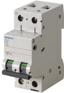
Miniature circuit breaker 400 V 4.5 kA, 2-pole, C, 1 A