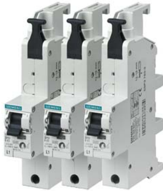
Main miniature circuit breaker (SHU), 1-pole, E 63A, 230/400 V (block with L1, L2, L3)