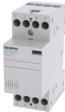
insta contactor with 4 NO contact for 230 V AC, 400 V 25 A control 230 V AC