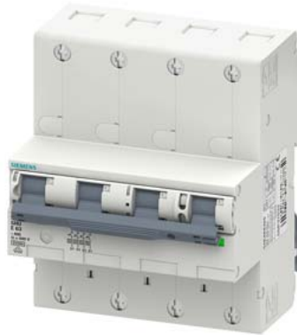
Main miniature circuit breaker (SHU), 4-pole, E 63, 400V