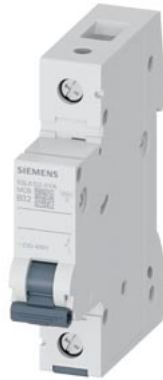
Miniature circuit breaker 230/400 V 6kA, 1-pole, B, 32 A