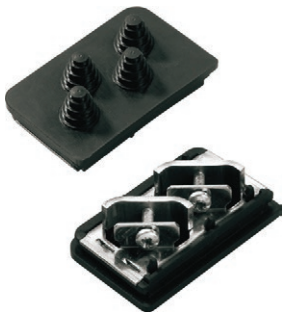
Plates with cable entries VW3L10100N●