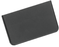
IP 54 sealing plate VW3L10000N●●

Accessories for ILA, ILE and ILS Integrated Drives