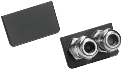
Kit with plate for cable entries and sealing plate VW3L10222