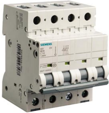
MCB Icu=15KA 400V 4P D20