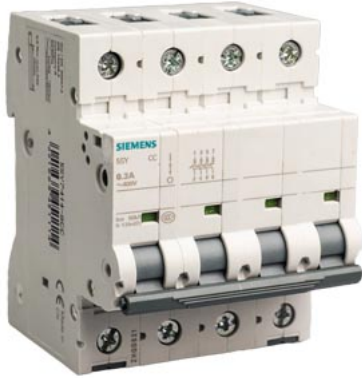
Miniature circuit breaker 400 V 10kA, 4-pole, D, 4 A for railway applications