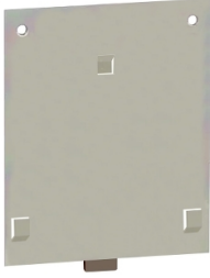
plate for mounting on Omega Phaseo ABT7 ABL6, DIN rail, for voltage transformer size 4