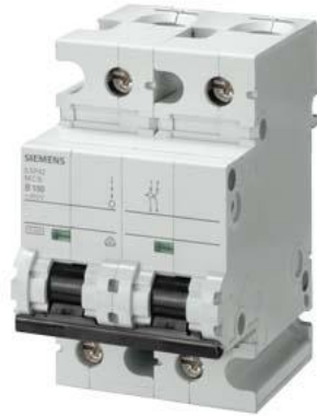
Miniature circuit breaker 400 V 10kA, 2-pole, D, 100 A, D=70 mm