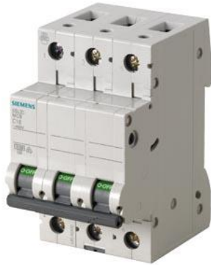
Miniature circuit breaker 400 V 4.5 kA, 3-pole, B, 10 A