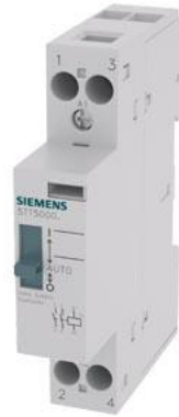
insta contactor 0/1-automatic with 2 NO contacts for 230 V AC, 400 V 20 A control AC/24 V DC