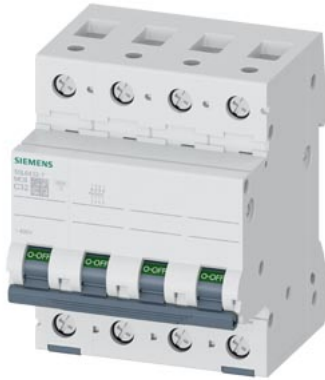
Miniature circuit breaker 400 V 6kA, 4-pole, C, 32 A