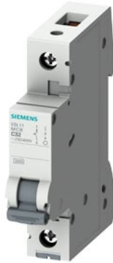
Miniature circuit breaker 230/400V 3kA, 1-pole, B, 6A