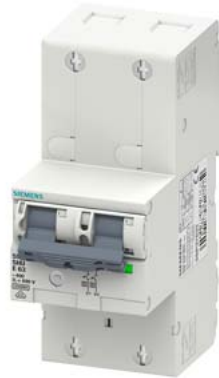
Main miniature circuit breaker (SHU), 2-pole, E 63, 400V