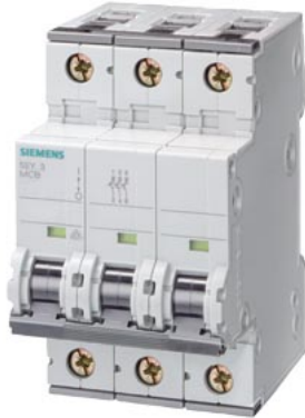
Miniature circuit breaker 400 V 25kA, 3-pole, 10A, D=70 mm only magnetic tripping