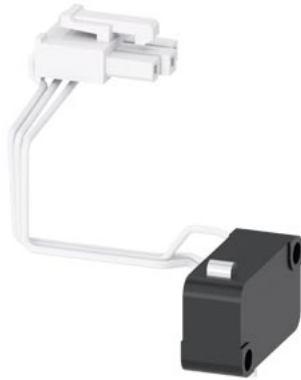
spring charge signaling switch S21 for digital signals 24 V DC accessories for circuit breakers 3WL10 / 3VA27 (SE)