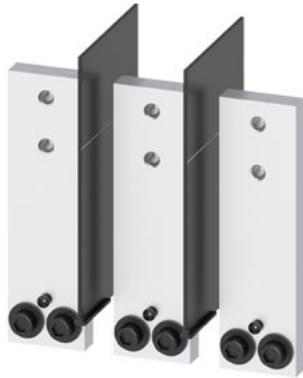
bus connectors extended front-side 3 units long, 1250 A accessories for: 3VA26