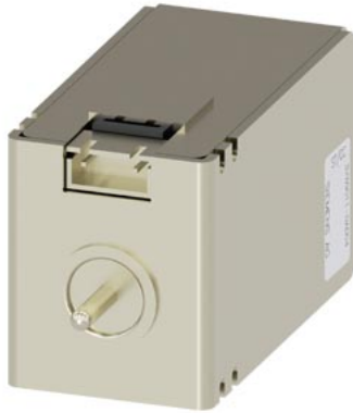
auxiliary solenoid 60 V AC/DC shunt release/closing coil (ST/CC) accessories for circuit breakers 3WL10 / 3VA27