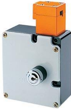
POSITION SWITCH, METAL-ENCLOSED, SPRING-ACTUATED LOCK, AC 230V, M20 X 1.5