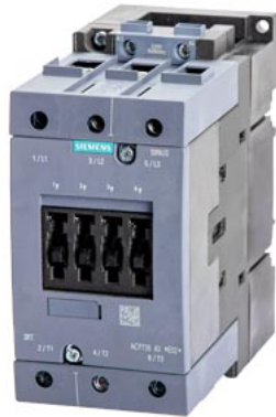
Contactora AC 240 V 50/60 HZ AC3 45 kW 400 V 3-pole, size S3, screw terminal